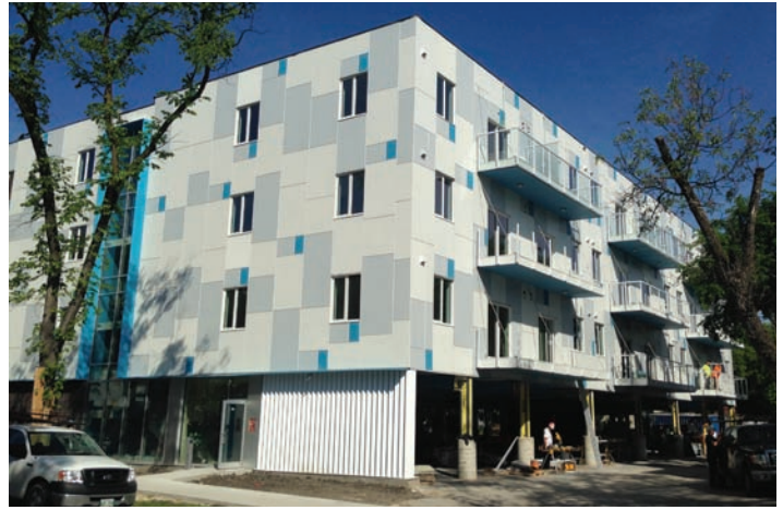
Tim Comack: "We've packed a lot of value into each unit."

"We're very proud of the team we assembled," said Comack. "The staff at Westland demonstrates great problem-solving skills and the people are easy to work with. When the team is working well together, you can tell far in advance how extraordinary the results will be." 🚧