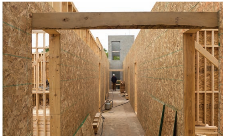
Craig Hildebrandt: "Construction went off without a hitch,"

CELEBRATING OVER 35 YEARS; CELEBRATING THE FUTURE