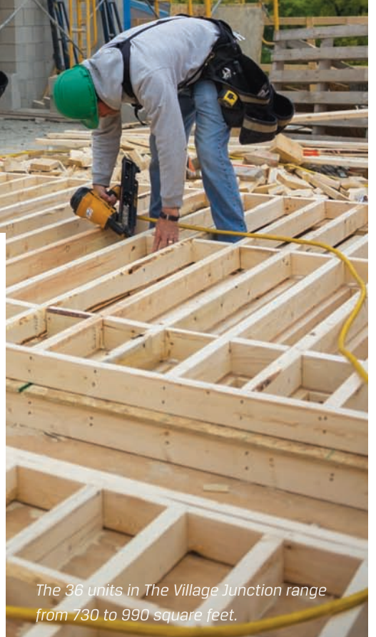
The 36 units in The Village Junction range from 730 to 990 square feet.