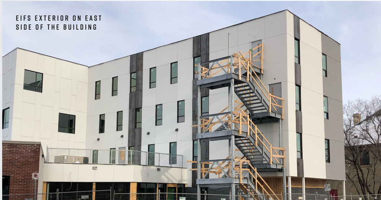
EIFS EXTERIOR ON EAST SIDE OF THE BUILDING

WE HAVE A GREAT DEAL OF APPRECIATION FOR NOT JUST THE COMPETENCY OF WORK, BUT FOR THE LEVEL OF TRUST AND TRANSPARENCY THAT WESTLAND HAS BEEN ABLE TO PROVIDE