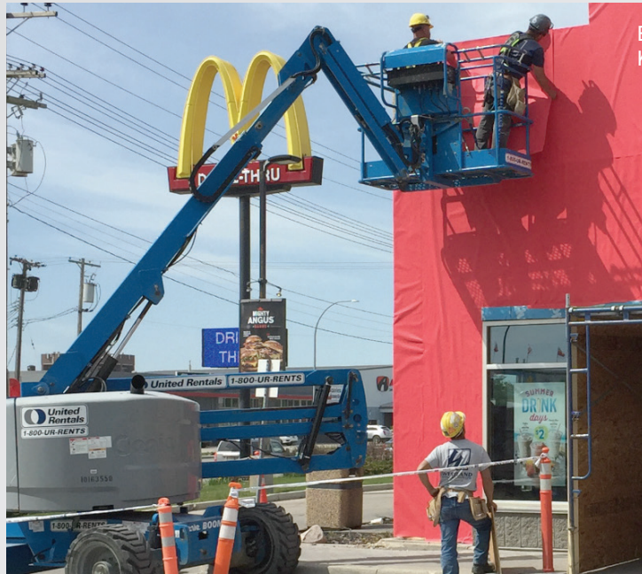
EXTERIOR WORK AT KING EDWARD STREET

I THINK THE FOUR OF US ACTUALLY HAVE A GREAT WORKING RELATIONSHIP, WHICH IS REALLY IMPORTANT THESE DAYS TO HAVE PEOPLE THAT RESPECT ONE ANOTHER, CARE ABOUT ONE ANOTHER, HELP ONE ANOTHER.