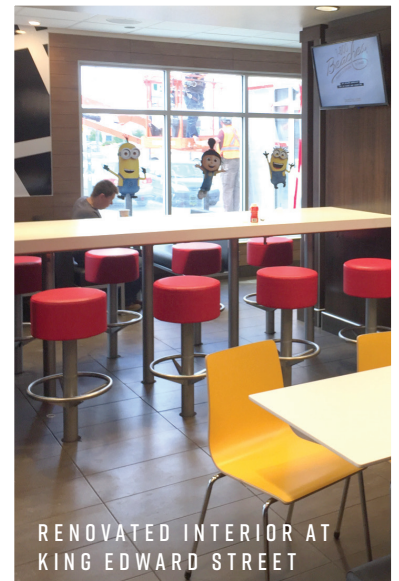
RENOVATED INTERIOR AT KING EDWARD STREET