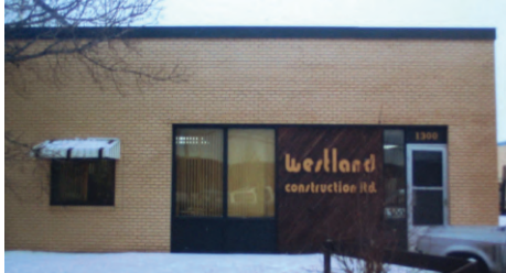
Westland's office from 1979 to 2006.

During the early years, one piece of office furniture – a picnic table – acted as a desk, filing cabinet, lunchroom and boardroom table. But in time, with Norm at the helm, the company started to grow, and Westland acquired both local and rural construction jobs.