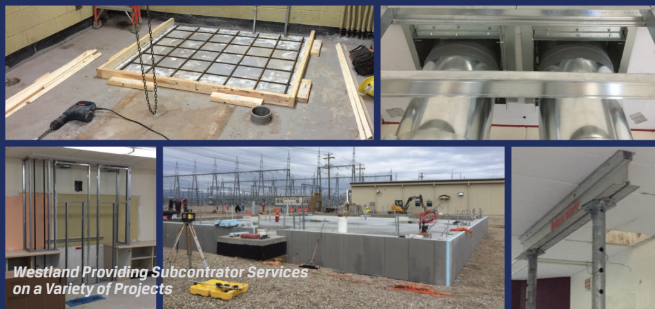
Westland Providing Subcontractor Services on a Variety of Projects