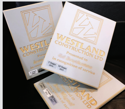
Westland presents its staff with "Years of Service" Awards. It's not unusual to see 10, 15, 20 and 25 year awards.

Let's just make sure the online component doesn't eliminate the face-to-face interaction that is still essential in our industry. See you soon! 📺