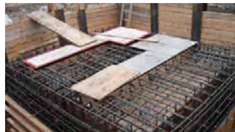
The overflow chamber in progress: the walls are seven metres high and 16 inches thick.